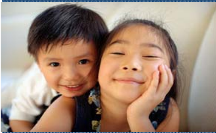
Milton Community Resource Centre