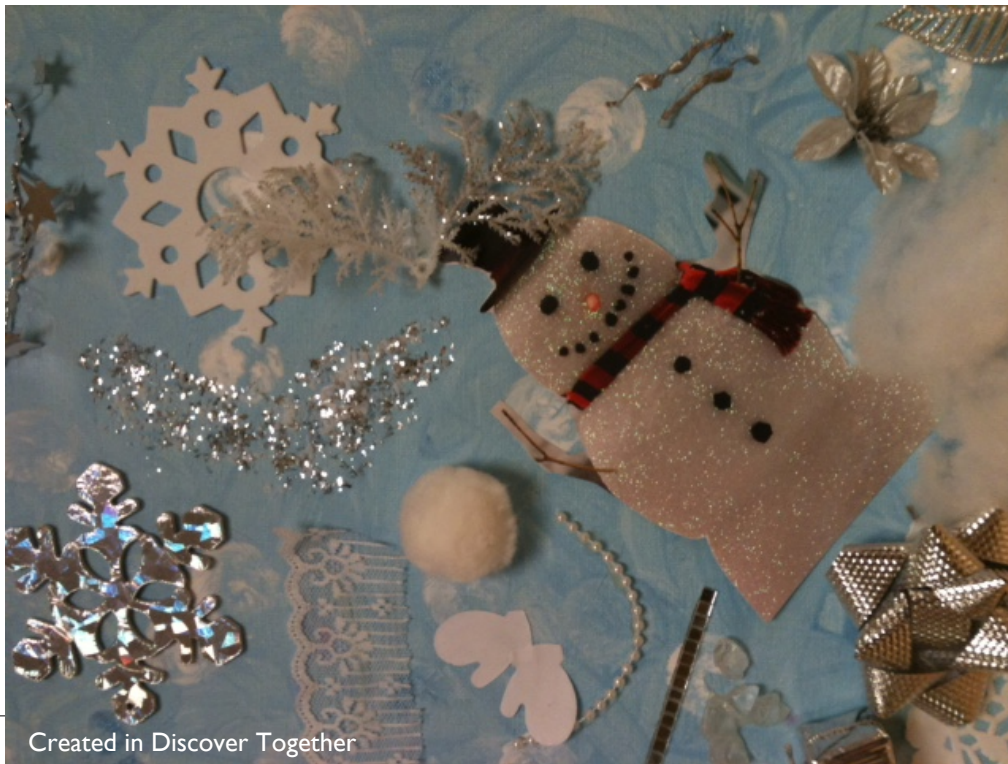
Created in Discover Together

410 Bronte Street South Milton, ON L9T 0H8 905-876-1244