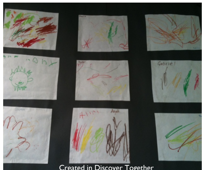
Created in Discover Together